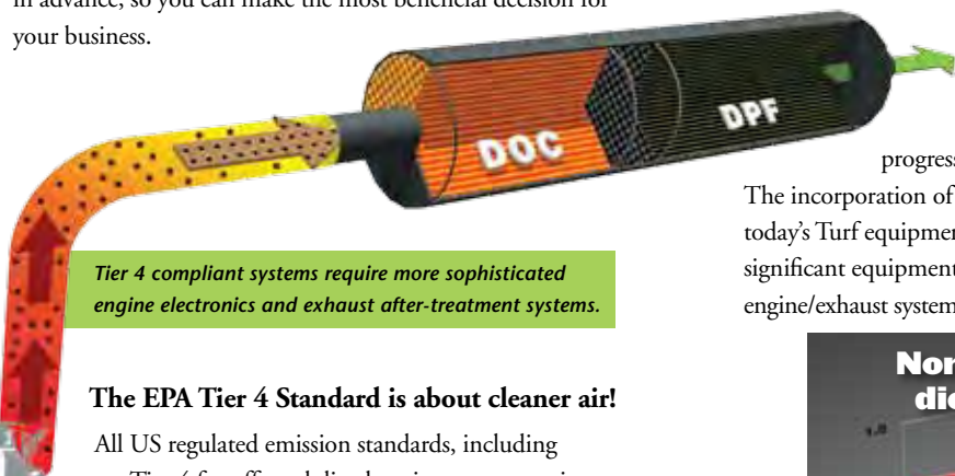
Tier 4 compliant systems require more sophisticated engine electronics and exhaust after-treatment systems.

Understanding the financial implications of various compliance options - today - will allow you to evaluate all of your options, in advance, so you can make the most beneficial decision for your business.